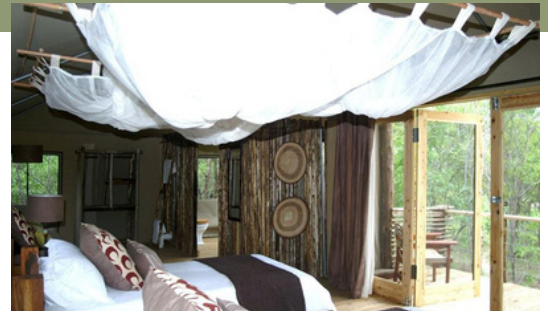
(Pictured above: Upgradable room)

The water is fresh and safe to drink. We will provide coffee, tea and juice however, any other soft or alcoholic beverages can be purchased on our town trips.